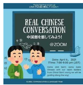
Chinese Talk Cafe