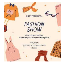
Digital Fashion Show